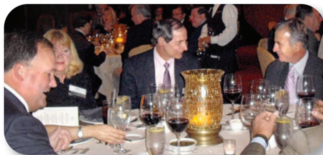
The Awards Dinner offered an opportunity for networking, which attendees stated throughout the program was a key reason for attending the conference.